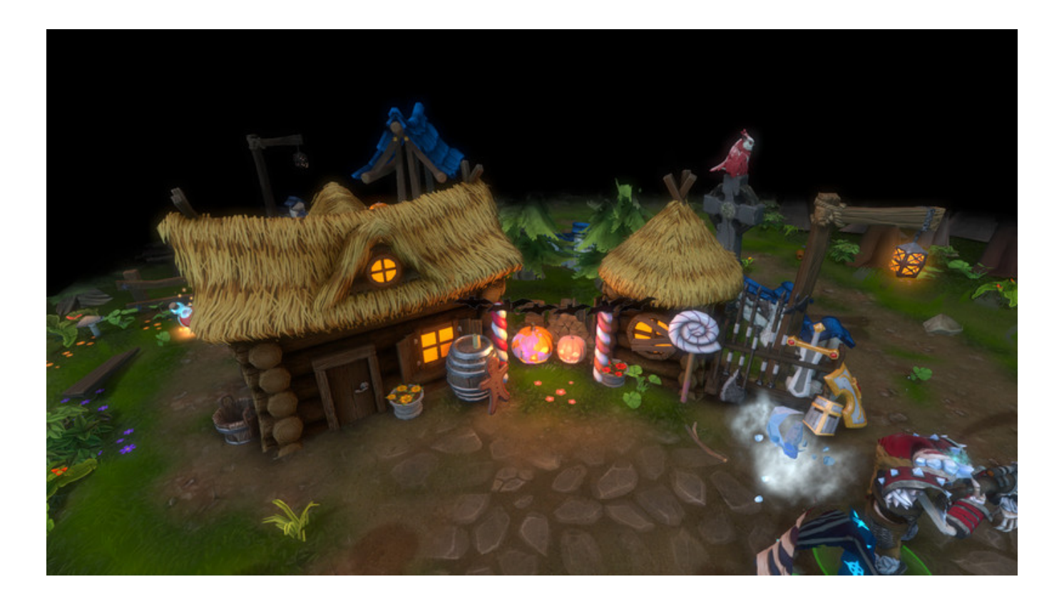
Tank Wars: Anniversary Edition Free Download [Crack Serial Key

Download >>> <a href="http://bit.lv/2SJUF0M">http://bit.lv/2SJUF0M</a>